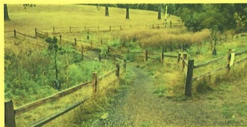
The Fanno Creek watershed spans more than 20,000 acres in the west and southwest of Portland. Encounter its diverse fish and wildlife on the Fanno Creek Trail and Greenway or several Portland parks.