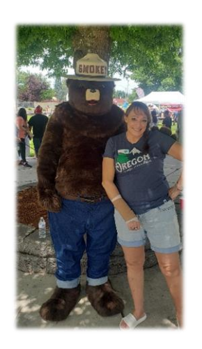
...AND THANKS TO THE MAYOR AND OTHER CITY STAFF FOR HELPING WITH SET UP AND TEAR DOWN