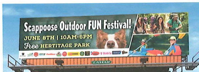
Outdoor Festival Billboard