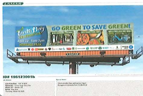
Earth Day Billboard:

Movies in the Park news story: https://www.columbiacountyspotlight.com/news/beat-summer-heat-with-scappoose-movies-by-moonlight-starting-friday/article_261b2388-5031-11ef-a582-8f8cfbc9b6e.html