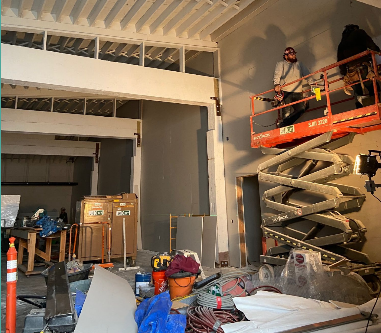
St Helen's Food Bank Interior Construction