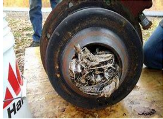
Flushed wipes clogged sewer pump

Many of today's products claim to be FLUSHABLE. But they are NOT.