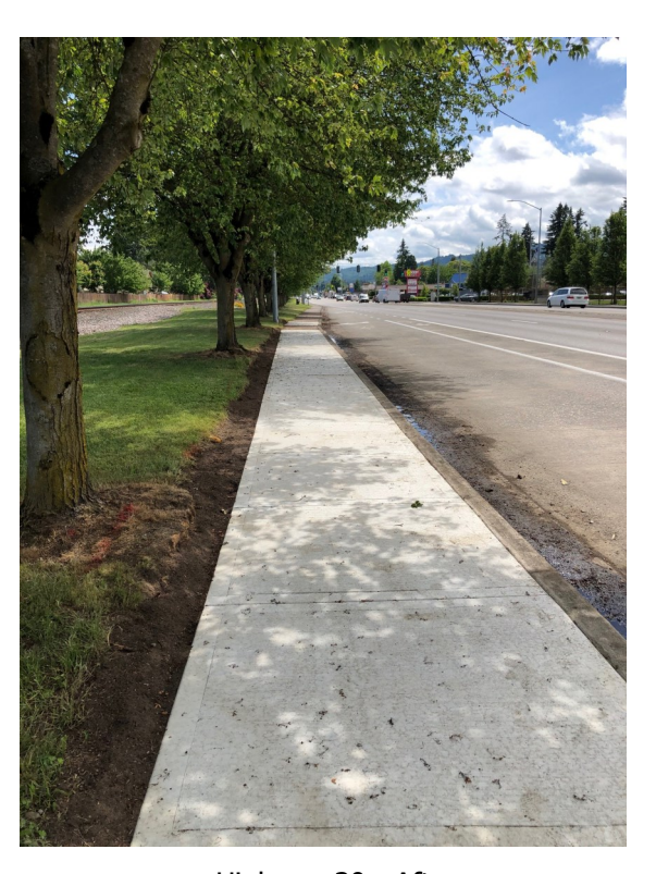
Highway 30 - After