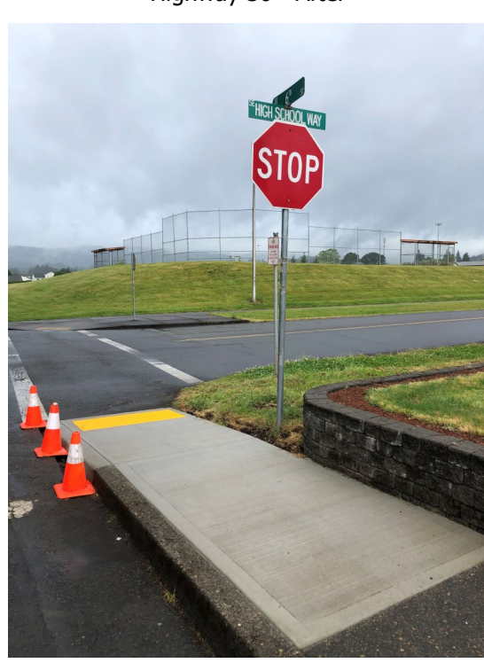
SE 6th Street & High School Way - After