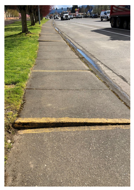
Highway 30 - Before

The City contracted with a local company to replace over 300 feet of hazardous sidewalk panels along the East side of Highway 30, a section which is the City's responsibility to maintain. In addition to the sidewalk repair on Highway 30, the City's contractor also replaced 7 ADA sidewalk ramps along SE 6th Street. These needed safety improvements are the first of several improvements that have been made possible by the Scappoose Local Fuel Tax. Below are some before and after examples of the work that was completed.