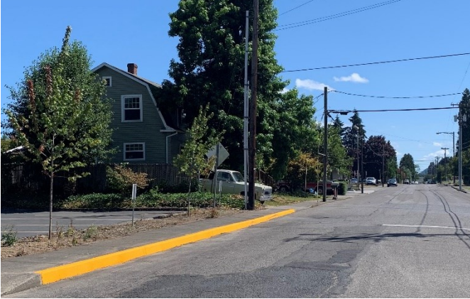
New curb paint on NW 1 st St. in front of Fire Station

In addition to the City's annual crack sealing program, you may have noticed fresh street and roadway markings around town over the past few weeks. Public Works crews have been re-painting crosswalks, stop bars, lane striping, and curbs across the city. Additionally, Public Works continues street sweeping, park maintenance and groundskeeping, and traffic sign maintenance.