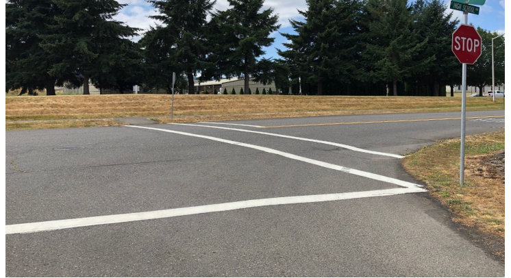
New crosswalk paint at SE 5 th & High School Way