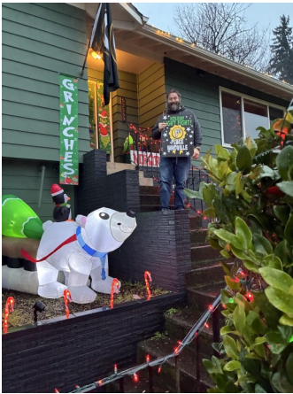
1st: #22 52559 NW Eastview Drive