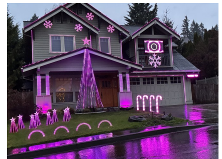
3rd: #23 52551 NW Maria Lane