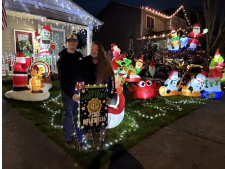
1st: #5 52192 SE Tussing Way