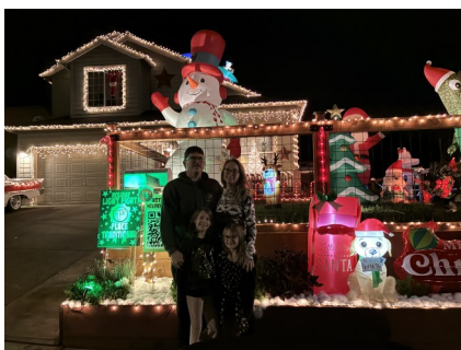
1st: #13 33691 SW Pickle Place