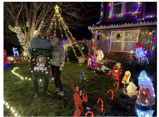
3rd: #10 51803 SE 8th Street