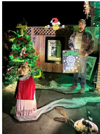
2nd: #16 33287 SW Barta Court