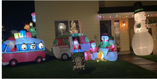
2nd: #4 34293 NE Sunset Loop