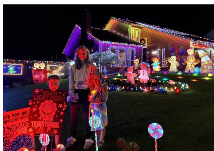
2nd: #26 32902 NW Sunset Drive